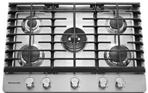
SUITE MATCH COOKING COOKTOP / MICROWAVE / VENTILATION KCGS550E