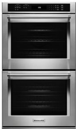
SUITE MATCH COOKING RANGE / WALL OVEN KODE300E

Be sure to tune into your customers' shipping priorities to bundle products across categories